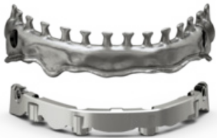
Atlantis® 2in1 (bridge and hybrid)

Intended for removable prosthesis on standard or custom bars. An extensive library of attachment provisions and bar profiles is available. Made by milling.