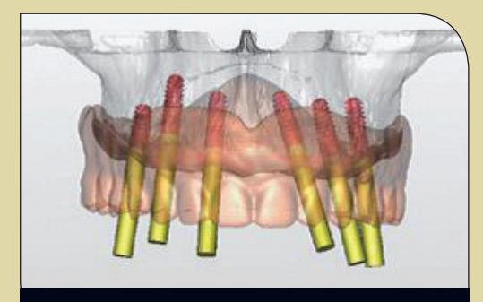
Plan the Case - $200

Whether it is a single or multi-implant case, our case planning services and surgical guides will help reduce stress and shorten chair time when placing implants. For more information, call Steve Daggett, CDT at our Waunakee laboratory (1-800-236-3859).