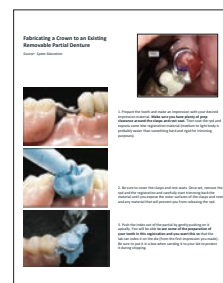
Crown under partial tip sheet under crown under partial