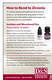
How to bond to Zirconia under cementation