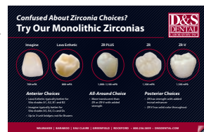
Monolithic Zirconia choices cheat sheet under ZR