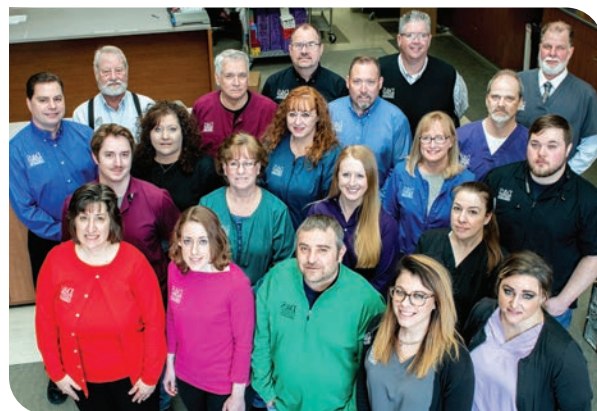
We're In This Together. The D&S Leadership Team located at the Waunakee Headquarters is here to help you navigate the new "normal" during the COVID-19 pandemic.