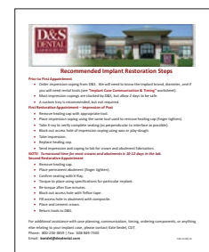
Implant flow charts under implants information